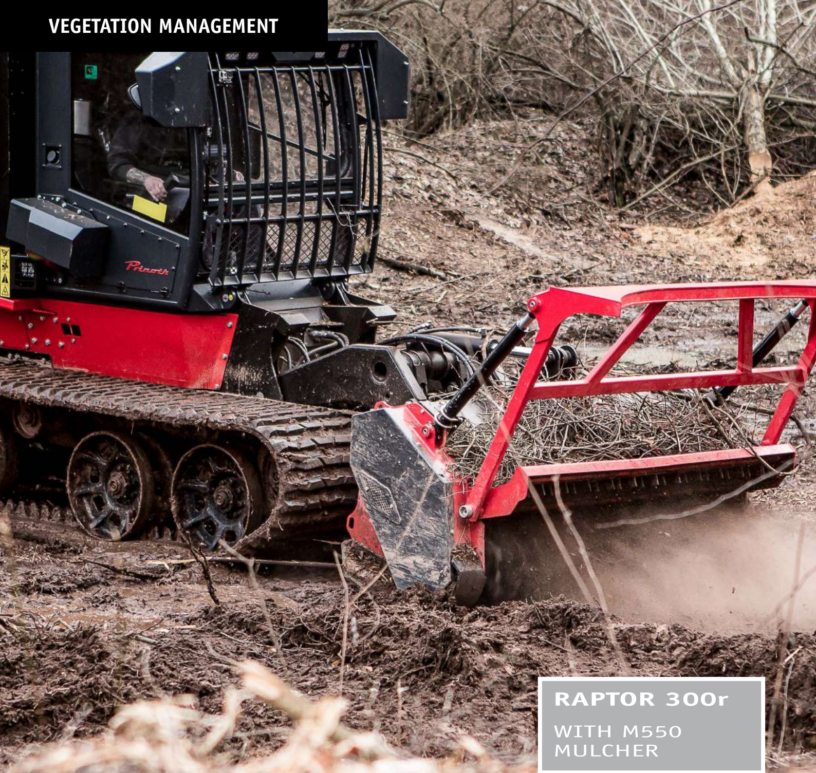
RAPTOR 300r WITH M550 MULCHER